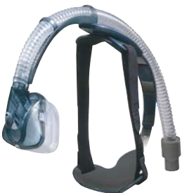
Breeze with DreamSeal