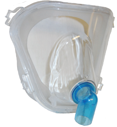
BiTrac SE MaxShield