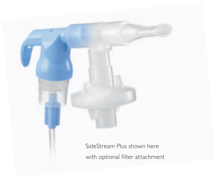
SideStream Plus shown here with optional filter attachment

Optional durable filter attachment (with disposable filter pads), or aerosol hose, for nebulizing antibiotics.